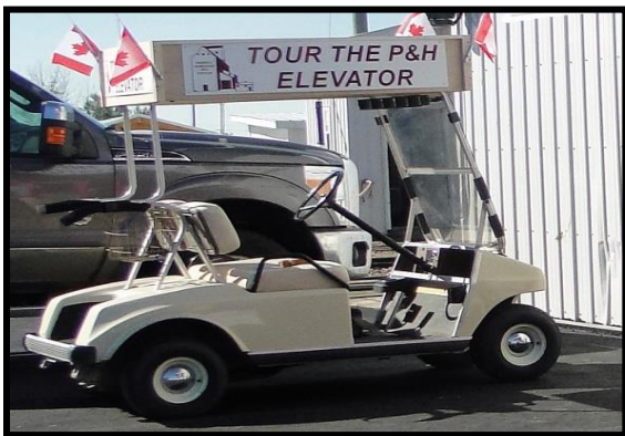
Elevator Hot- Rod

We had an opportunity to purchase a golf cart at a reasonable price. Signs have been installed on the cart to tell train customers that tours are available at the elevator. With our summer student Angela running the cart and telling people about the elevator the number of tours has definitely increased. It has also helped to transport people that may not have been able to walk around the train and over to the elevator for a tour.