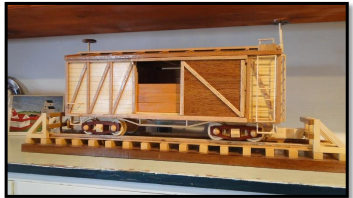
Grain car located in the Feed Shed

We were honored to receive a grain car to add to our wooden train set. Don Porter from Port Alberni, British Columbia crafted a beautiful grain car to go along with the highly admired train set (also crafted by Don) we have on display. This Train set along with the elevator model crafted by Clyde Rigsby are the feature displays in our feed shed.