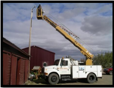
Yard Light Installation