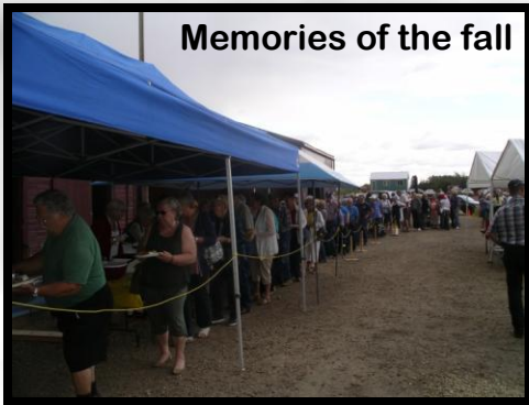
Memories of the fall supper

The hail storm that hit Stettler this summer did a fair bit of damage including broken windows, siding and shingles torn off. The coal shed suffered the most damage and will require a new paint job next year