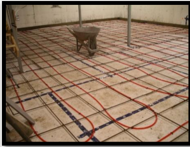
Preparation of Floor