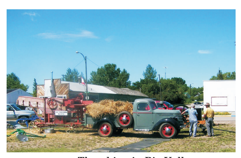
Threshing in Big Valley

The Threshing demonstration was well received and created positive feedback. The "East Central Alberta Review" newspaper carried a front page picture and story about our Society We also plan to take the outfit to Meeting Creek on August 23 - weather permitting, for their annual Canadian Northern "Prairie Fun Days". Join us in Meeting Creek and experience an authentic fully restored railroad station, elevator office - complete with elevator engine and grain elevator.