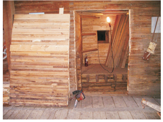
Annex Bin Opened Up