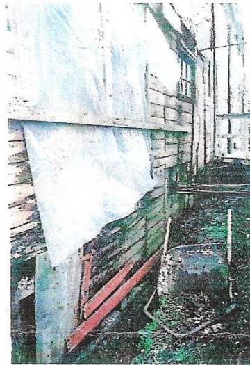
East wall of feed mill. Spring, 2007

The coffee stop continues to be open on Tuesday, Wednesday, and Thursday mornings. Drop in and have a coffee and a visit.