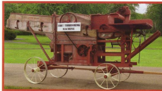
Little Giant 1887 Hand Fed Threshing Machine

THE ELEVATOR IS IN WORKING ORDER. IN THE FUTURE, WITH THE HELP OF OUR MANY VOLUNTEERS, WE HOPE TO RESTORE AND PRESERVE IT AS A DEMONSTRATION ELEVATOR AND FEEDMILL