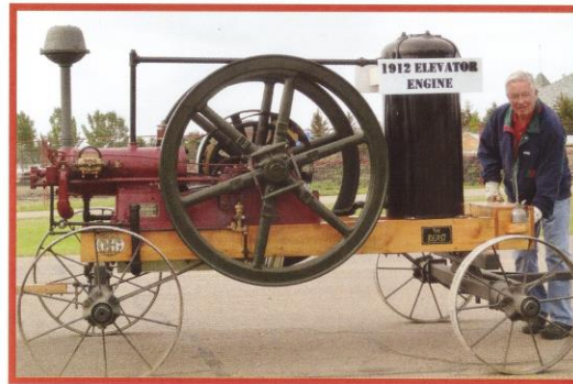
10 HP International 1912 Elevator Engine