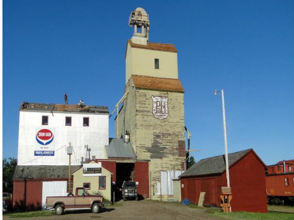
“Shingling in Progress”