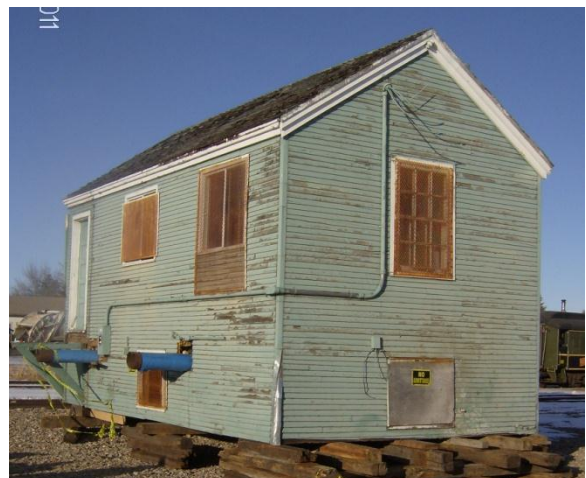
“Sun Alta Office”