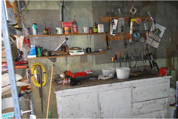
“Tool Room – Before”