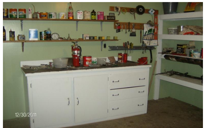
“Tool Room – After”