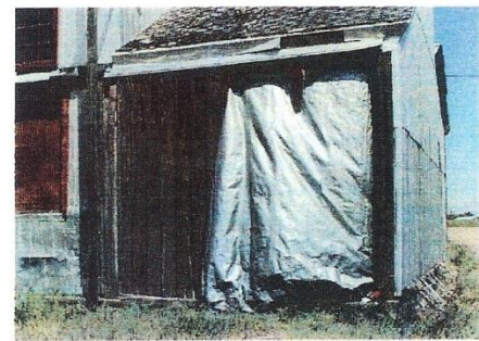
Feed Mill Drive Through Door Spring 2009

All profits help with the preservation of the elevator.