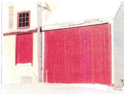
Feed Mill Drive Through Door. Winter 2009

Have you got your 2010 membership? We would greatly appreciate you considering a 2010 membership if you have not purchased one. We are applying for a grant in 2010 and we will be required to have matching funds.